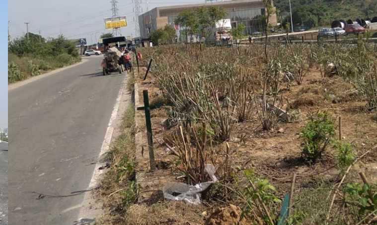
ACTUAL IMAGES OF SECTOR 76 & 77